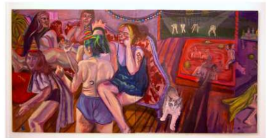
PHYLLIS GORSEN Campfire Companions, 2021

106 x 213 x 4 cm (h x w x d) Oil and Acrylic on Panel